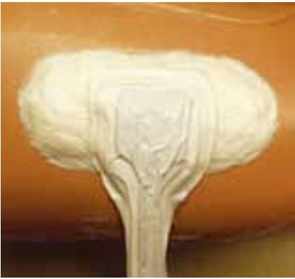
Gauze with Soft Port